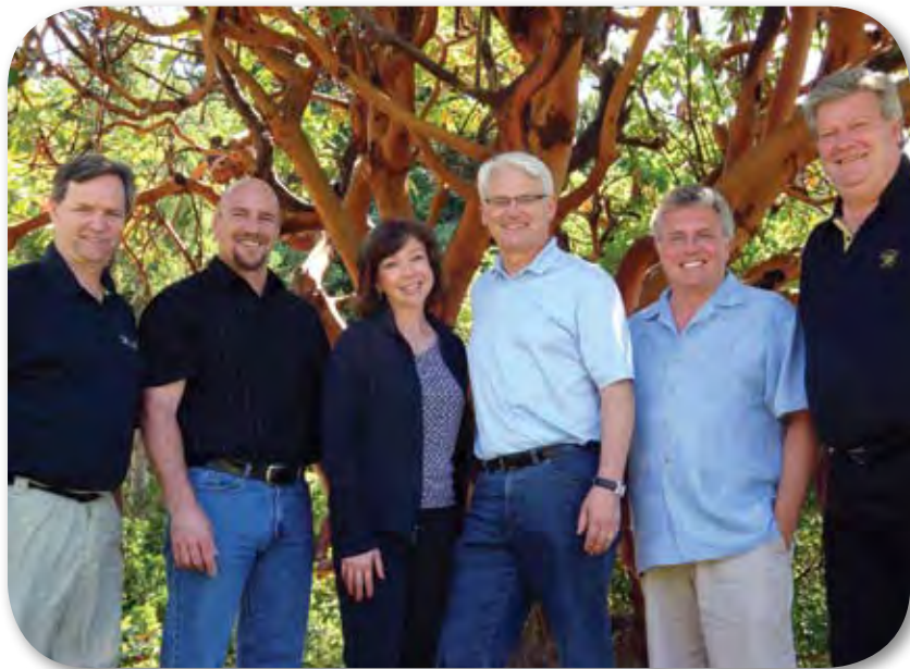
(Left to right): Honourable George Abbott, Minister of Health Services; Honourable Blair Lekstrom, Minister of Community Development; Honourable Mary Polak, Minister of Healthy Living and Sport; Honourable Gordon Campbell, Premier of British Columbia; Honourable Murray Coell, Minister of Advanced Education and Labour Market Development; Honourable Rich Coleman, Minister of Housing and Social Development

The Province is committed to building the best system of support in Canada for our older citizens. The Seniors' Healthy Living Framework will help us achieve this goal, making British Columbia the best place on earth for older people.