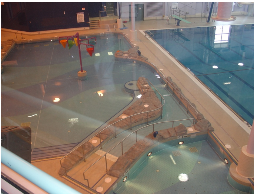
Dawson Creek's new Sportsplex and accessible swimming pool