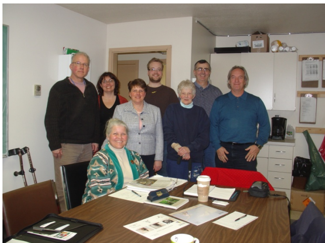
Meeting at Canal Flats Council Chamber